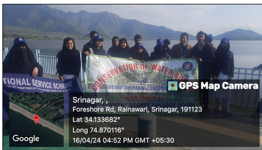
Students participating in the Awareness Programme on 'Conservation of Water Bodies'